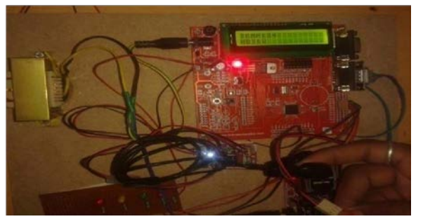
Figure-5: Sensors output values on PC